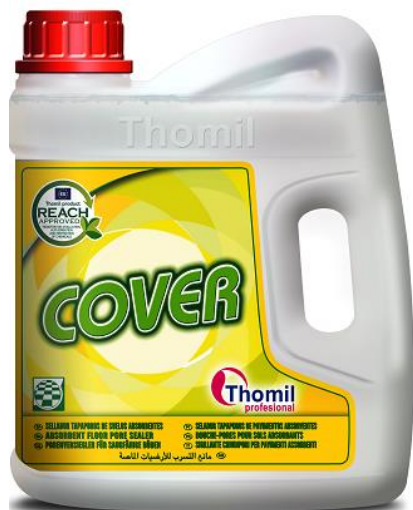
Absorbant-floor pore sealer